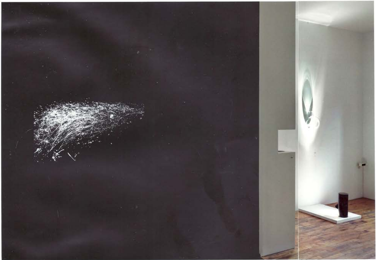
Sylvia Saldie Installation view of the exhibition The Absent Present at Prelix Institute of Contemporary Art (Toronto) 2014