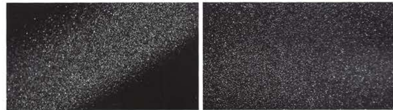
Video stills of Dust and Light (2009) by Sylvia Safdie

The artist works fluidly across media, making connections between materials, formats, scale and concepts of place and time. In her Earth