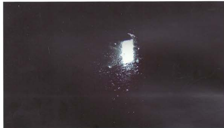
Video still from Reflection/Auschwitz II (2011) by Sylvia Safdie

The absence of sound in all three videos focuses attention exclusively on the elusive and subtle visual transformations at play. This silence, and Safdie's choice not to represent the built environment of Auschwitz-Birkenau is significant