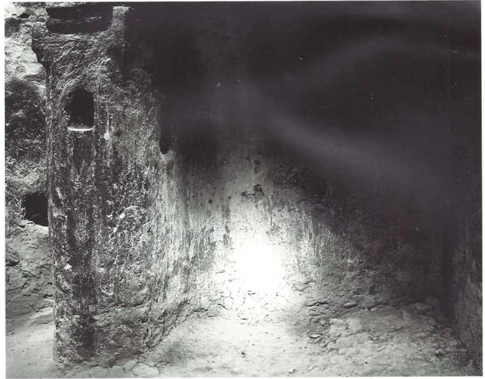
Sylvia Safdie Selections from Amzrou 2012 COURTESY SYLVIA SAFDIE