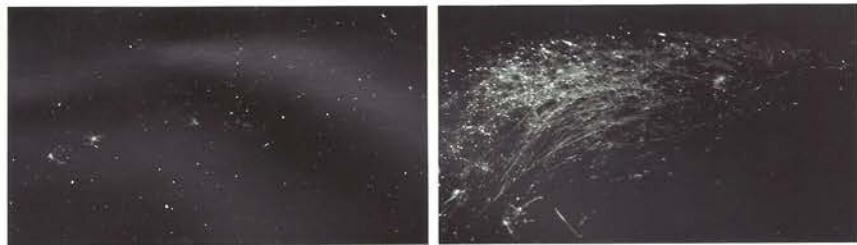
Video stills from Web/Auschwitz Series I, Nos. 2 and 4 (2011) by Sylvia Safdie